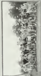
Cross - Country Squad